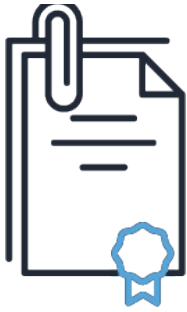
Wills & Trusts